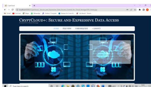
Fig 8: STA's home page after login of STA