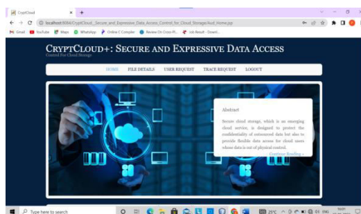
Fig 6: Auditor's home page after login of auditor