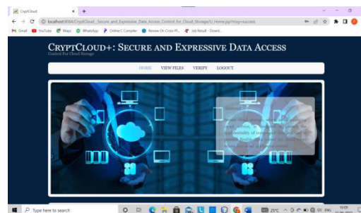
Fig 4: Data user's home page after login of data user