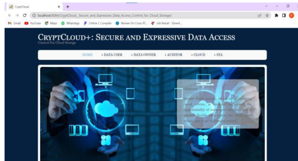
Fig 2: Home Page of Crypt cloud