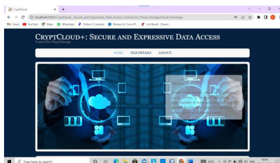
Fig 7: Cloud's home page after login of cloud