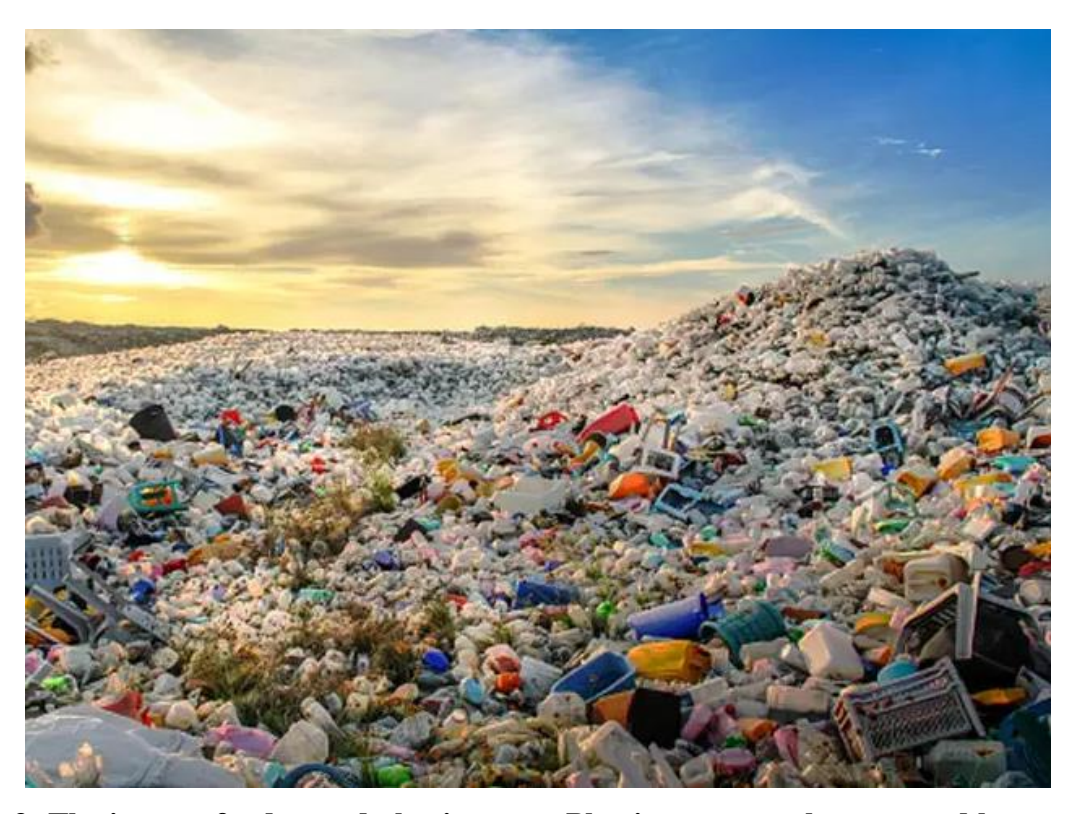
Figure 3: The image of a dumped plastic waste. Plastic waste can be managed by recycling; if they are not recycled, they can become a major pollutant in the atmosphere.

© 2012 IJFANS. All Rights Reserved, UGC CARE Listed (Group -I) Journal Volume 11, Iss 7, July 2022