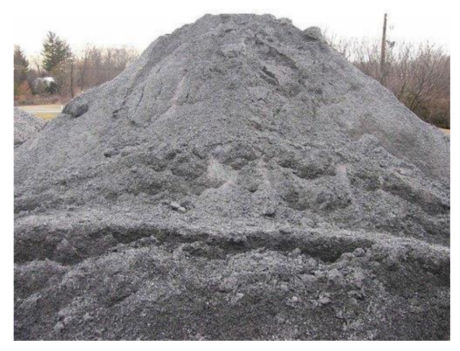
Figure 4: The image of M Sand. M-Sand is a replacement of river sand for the construction of concrete building [Indiamart].

© 2012 IJFANS. All Rights Reserved, UGC CARE Listed ( Group -I) Journal Volume 11, Iss 7, July 2022