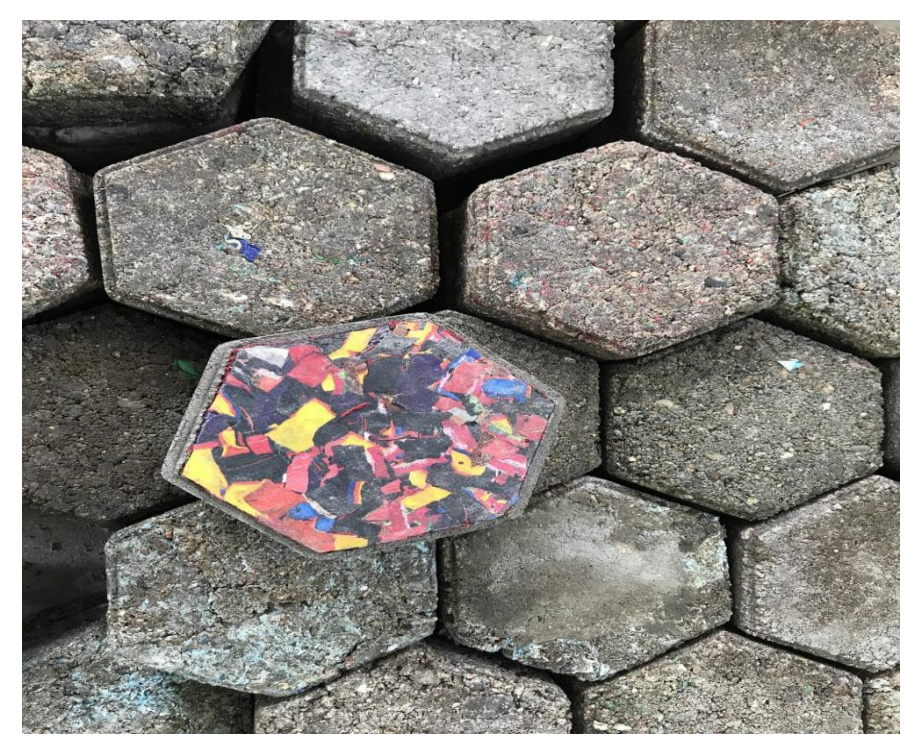
Figure 1: The above figure shows the road built with the wastes [bangkokpost].

have failed due to their versatility in everyday use. Since the recycling and reuse of plastic waste materials requires a large amount of labor and a high production expense, only a limited percentage of plastic waste is recycled and used, with the remainder ending up in incinerators, landfills and dumps. Currently the challenge is in what way to best diminish the effects of plastic waste for the least amount of money. Several studies have attempted to use plastic waste, but only a handful have considered its use in concrete in various ways. Figure 1 shows the road built with the wastes[4].