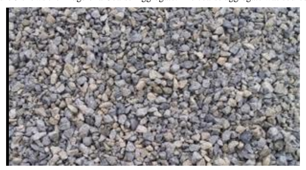
Figure 5: The image of a Coarse Aggregate. The coarse aggregate was sourced locally [civilclick].

The coarse aggregate was sourced locally. Aggregates that passed through a 12mm sieve and were maintained on a 10mm sieve were sieved and measured according to Indian Standard IS: 383-1970. Figure 5 shows the image of a Coarse Aggregate. The coarse aggregate was sourced locally.