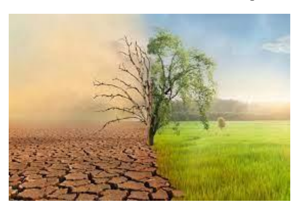
Figure 3: Climate Change

Even with environmental change, humanity bears a significant commitment to make an unequivocal move to moderate its belongings and adjust to the moving natural real factors. As stewards of the planet, we are answerable for tending to the main drivers of environmental change, like ozone harming substance emanations, deforestation, and impractical asset utilization.