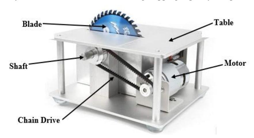
Figure 1: Represents the Design of Bench-Top Type Table Saw Used for Various Cutting Operations.

Bench-top table saw is small and light, and they're meant to be used on a table or other surface as shown in Figure 1. Homeowners and Dyers are the most common users of this sort of saw. They nearly always have a universal direct-drive motor. Some early versions had tiny induction motors that were not particularly strong, causing the saw to be heavily weighted and vibrate more. The most current saw can be lifted and transported by one person to a specific spot. Steel, aluminum, and plastic are commonly used in these saws, which are the cheapest and least competent of the table saws, yet they can handle most tasks with enough ripping capacity and precision.