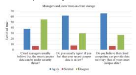
Figure 1: Managers and users' level of trust in cloud storage

option to store their valuable data despite the security challenges and issues.