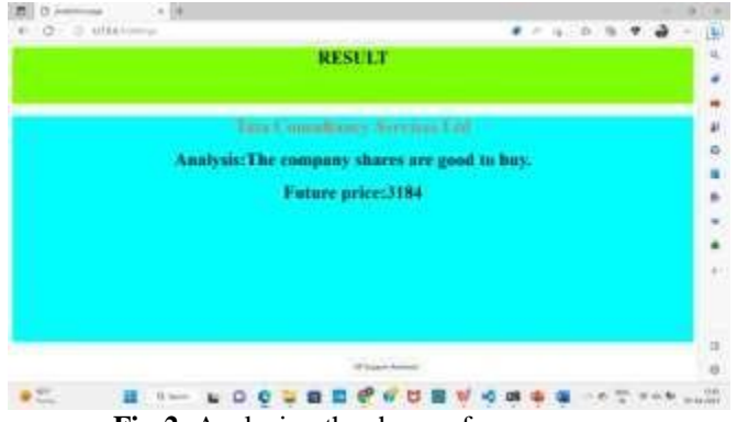
Fig-2: Analyzing the shares of company