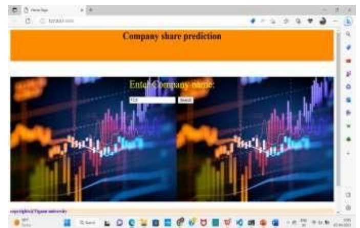
Fig-1: Search for company name