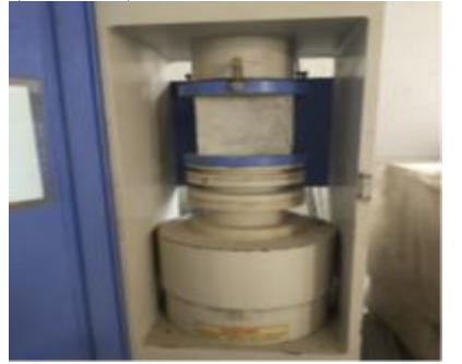
Fig-4.2. Specimen loaded into testing machine

10. Concrete cube average compressive strength=(load/area)