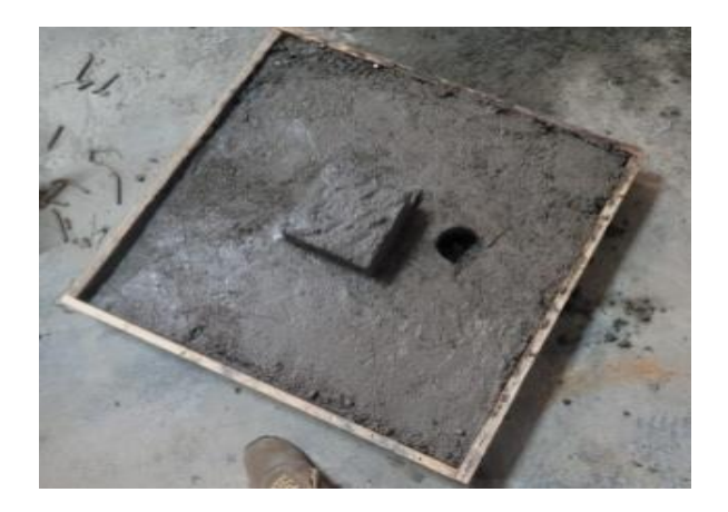
Fig 1: Flat Plate Specimen with & without opening

© 2012 IJFANS. All Rights Reserved, UGC CARE Listed ( Group -I) Journal Volume 11, Iss 10, Oct 2022