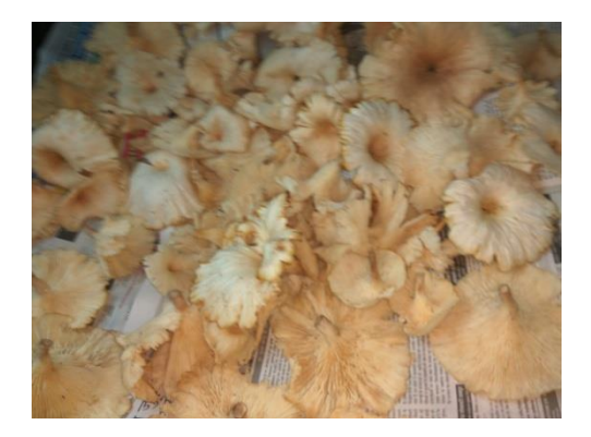
Figure 3.1: Cantharellus sp. Mushroom collected from the forest of Balaghat, Madhya Pradesh, India.

© 2012 IJFANS. All Rights Reserved, UGC CARE Listed (Group -I) Journal Volume 12, Iss 1, Jan 2023