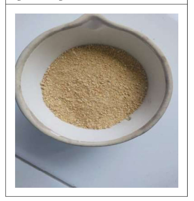
Figure 3: Orange Peel

Orange peel powder has the radial scavenging activity which has majority responsible for glowing skin action. Orange is citrus fruit which contains different nutritional source such as vitamin C. Calcium, potassium and magnesium. It also prevent acne, blemishes, wrinkles and aging.<sup>[2, 6]</sup>