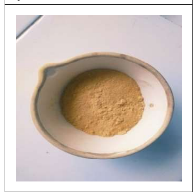
Figure 1: Fullers Earth

cooling action soothes the skin, and give relief to inflammation caused by aggravated pitta. It remove dirt and dead skin cells accumulated and replace with fresh radient and glowing skin.<sup>[14, 6]</sup>