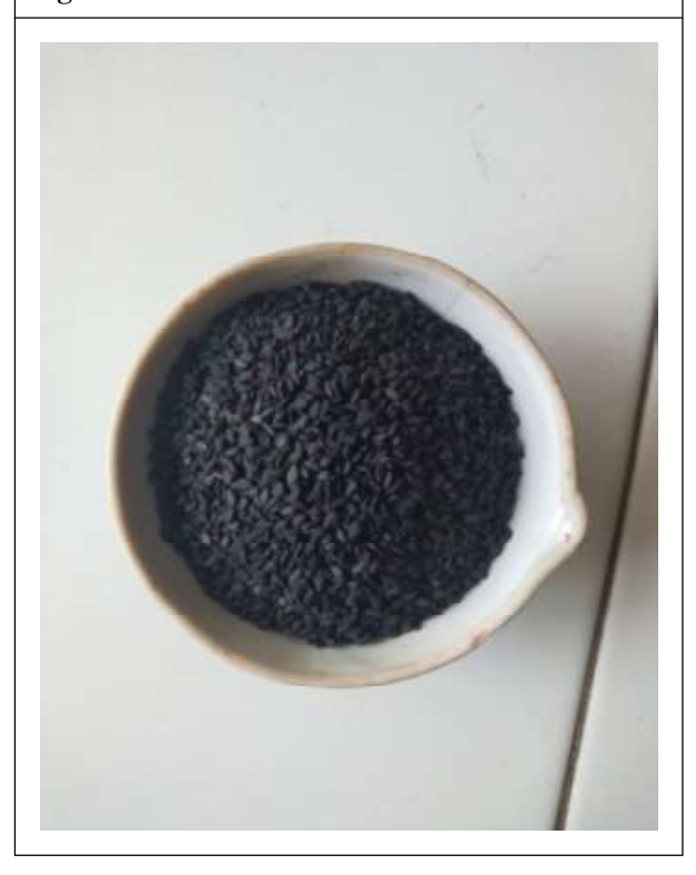
Figure 9: Sesame Seed

Sesame oil contains sesamum that has anti-inflammatory properties. This compound mainly help to ease the inflammation associated with acne breakouts.