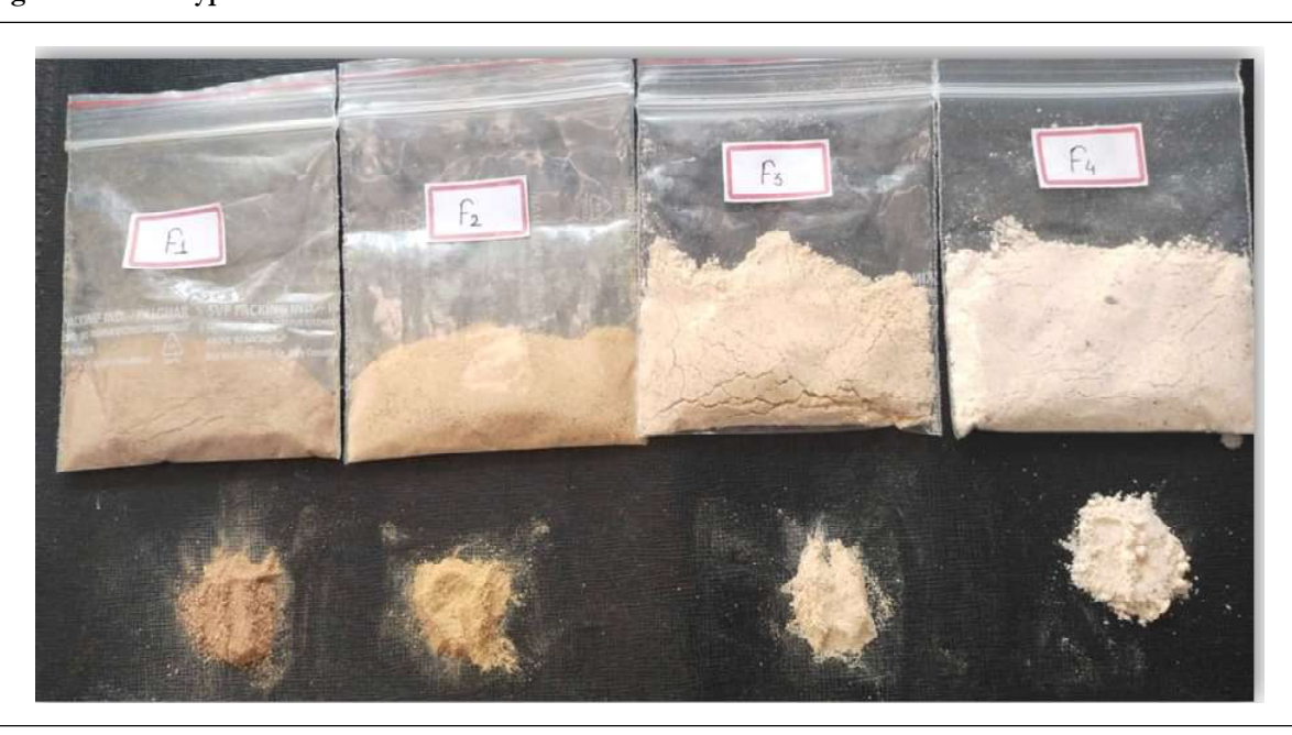
Figure 11: Four Types of Formulations

The result of evaluation test carried out of a face pack which includes nature, color, odour, taste, texture, ash values, mixture, contents and pH of dried powder provide information about organoleptic and physiochemical evaluation.