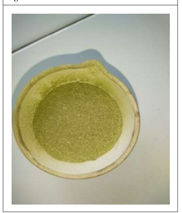
Figure 2: Neem

Neem has antibacterial, anti-inflammatory antiseptic and highly beneficial for acne prone skin and oily skin. An Antiacne property is due to the antioxidant, anti-inflammatory and anti-microbial activity of various phyto-constituents of neem.<sup>[6, 5]</sup>