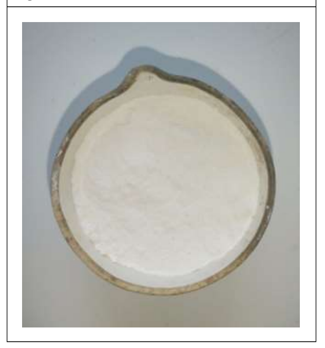
Figure 8: Rice

The powder of Oryza ativa have antioxidant property due to which it provide good effect on face skin<sup>[5]</sup>.