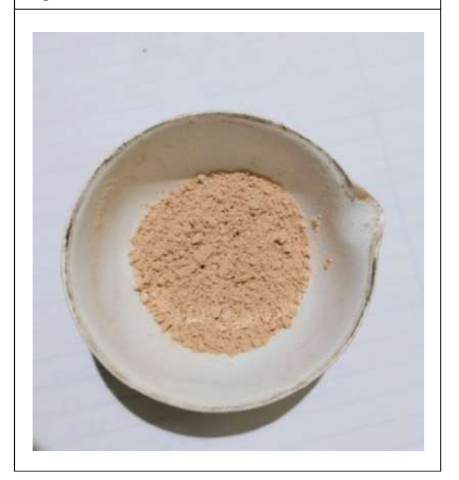
Figure 10: Sandal Wood

such as tanning effect , sodium carbonate, sodium palm kemelate, etc. ^{[6]}