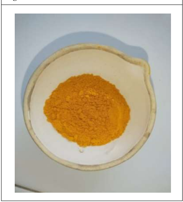
Figure 5: Turmeric

Turmeric has been shown to anti-inflammatory, antimicrobial, antioxidant properties. It mainly use for rejuvenate the skin. It is best source of blood purifier. It is effective in treatment of acne due to its antimicrobial, antioxidant and anti-inflammatory property. It also reduce the oil secreation by sebaceous glands.<sup>[13, 6]</sup>