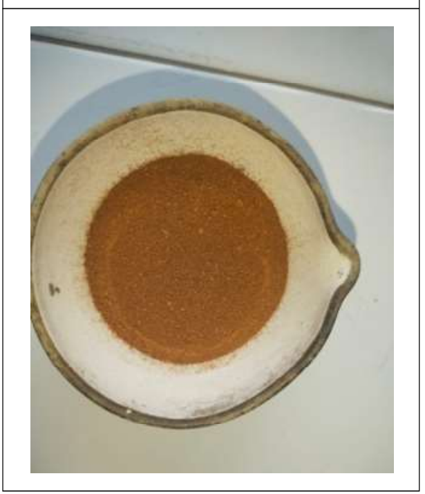
Figure 4: Shalmali

The throne of bombax ceiba have antioxidant and antiinflammatory activity. It has application to curve acne.<sup>[3, 7]</sup>