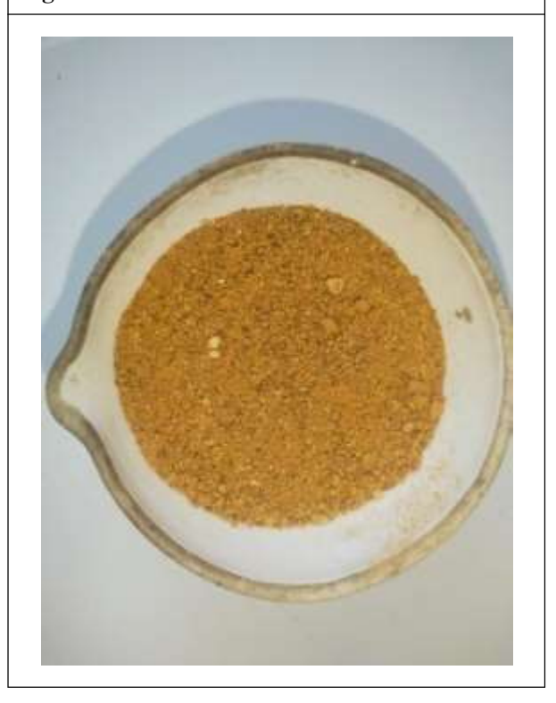
Figure 7: Tomato

Tomato have the antioxidant properties, due to which it has application on acne prone skin and dull skin. It rejuvenate the skin.<sup>[9]</sup>