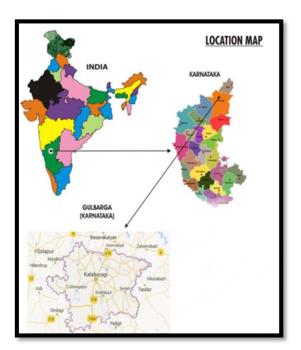
Figure 1: Study Area Kalaburagi

Kalaburagi in Figure 1 (Earlier Gulbarga) refers to stony land in the north-eastern part of Karnataka. Kannada is the primary language spoken in Kalaburagi. Kalaburagi is well known for the historic buildings that the Bahamian kings built. Additionally, it serves as a commercial hub for Hyderabad and Karnataka. The center is prepared as a regional marketplace and facility hub for the area in addition to its educational capacity. Due to its location in a low-income area, the city has been the focus of numerous development initiatives that have drawn residents from nearby neighborhoods. The administrative hub of Kalaburagi, one of 30 districts in Karnataka, is situated here. Kalaburagi, which has a 10,951 Km<sup>2</sup> area, is located in the Deccan Plateau at 17°-33" North and 76°-83" East. Both urban and rural areas of Kalaburagi were used for the study.