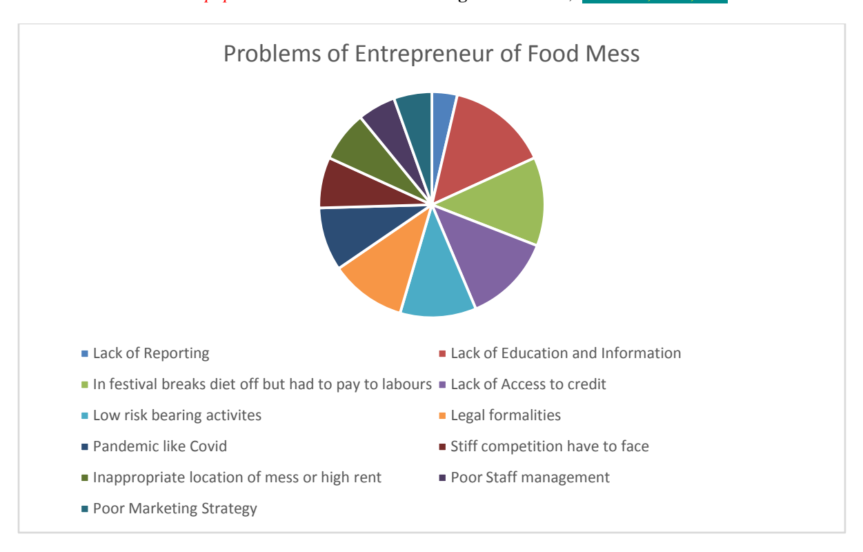
Table No. – 2 – Problems faced by entrepreneur of food mess N-200

Research paper © 2012 IJFANS. All Rights Reserved, Volume 11, Iss 10, 2022