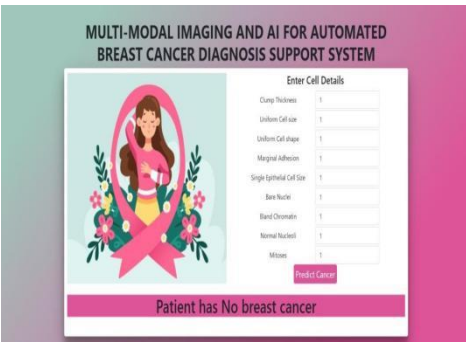
Figure 3: Output screen of patient with no breast cancer