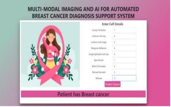
Figure 2: Output screen of predicting cancer with random values