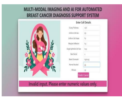
Figure 4: Output screen of entering invalid inputs