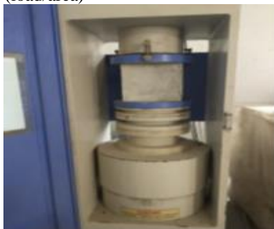
Fig-4.2. Specimen loaded into testing machine