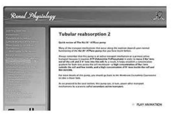
Figure 2: Screen capture of a section page in the modified UK module in Stage 2 The more details added could serve two purposes: to allow students to get a general understanding of topic concepts by skimming through the text first, before they view the animation; and to allow students to learn more in detail after they have viewed the animation.

Research paper© 2012 IJFANS. All Rights Reserved, UGC CARE Listed (Group -I) Journal Volume 11, Iss 12, 2022