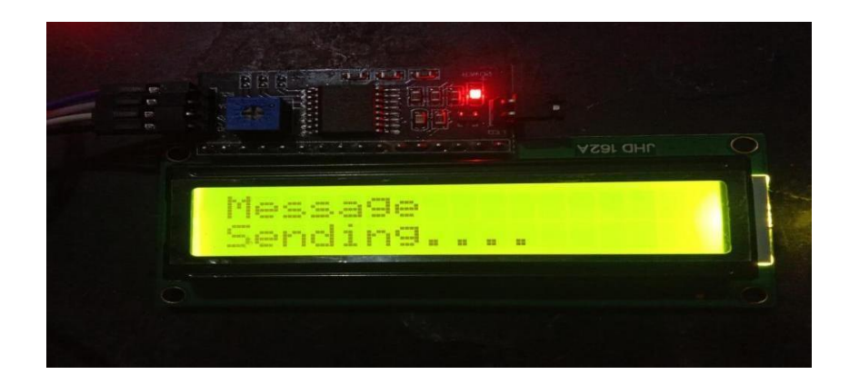
Fig 3 Sending message

GSM Searching for the signal to send message to the farmer.