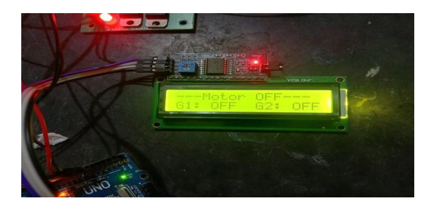
Fig 5 Status of motor

Based on the status of the field message is sent to user mobile via GSM.