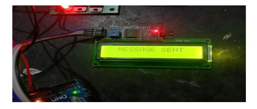
Fig 4 Message sent

© 2012 IJFANS. All Rights Reserved, UGC CARE Listed (Group -I) Journal Volume 12, Iss 1, Jan 2023