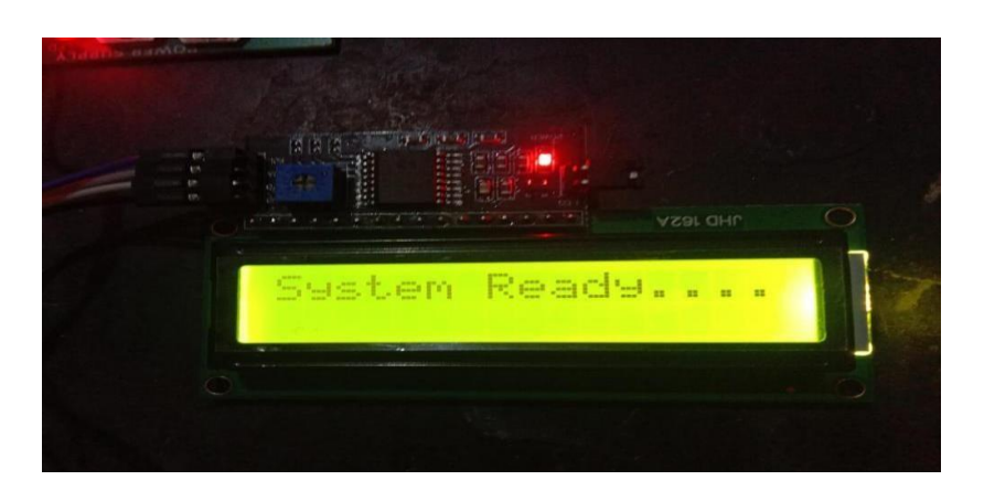
Fig 2 System ready

When system is turned on project name is displayed on LCD.