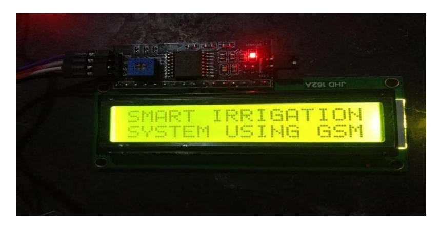
Fig 1 Project name display

© 2012 IJFANS. All Rights Reserved, UGC CARE Listed ( Group -I) Journal Volume 12, Iss 1, Jan 2023