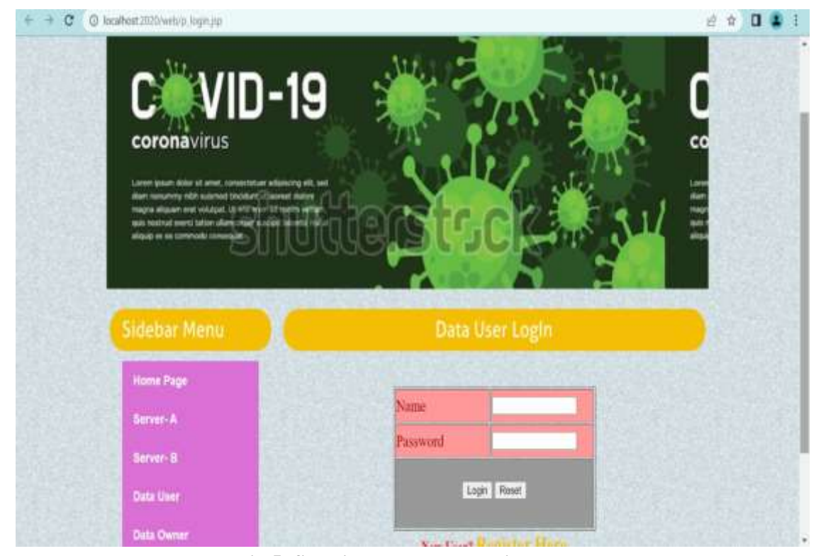
Fig 5: Showing Data User Login page