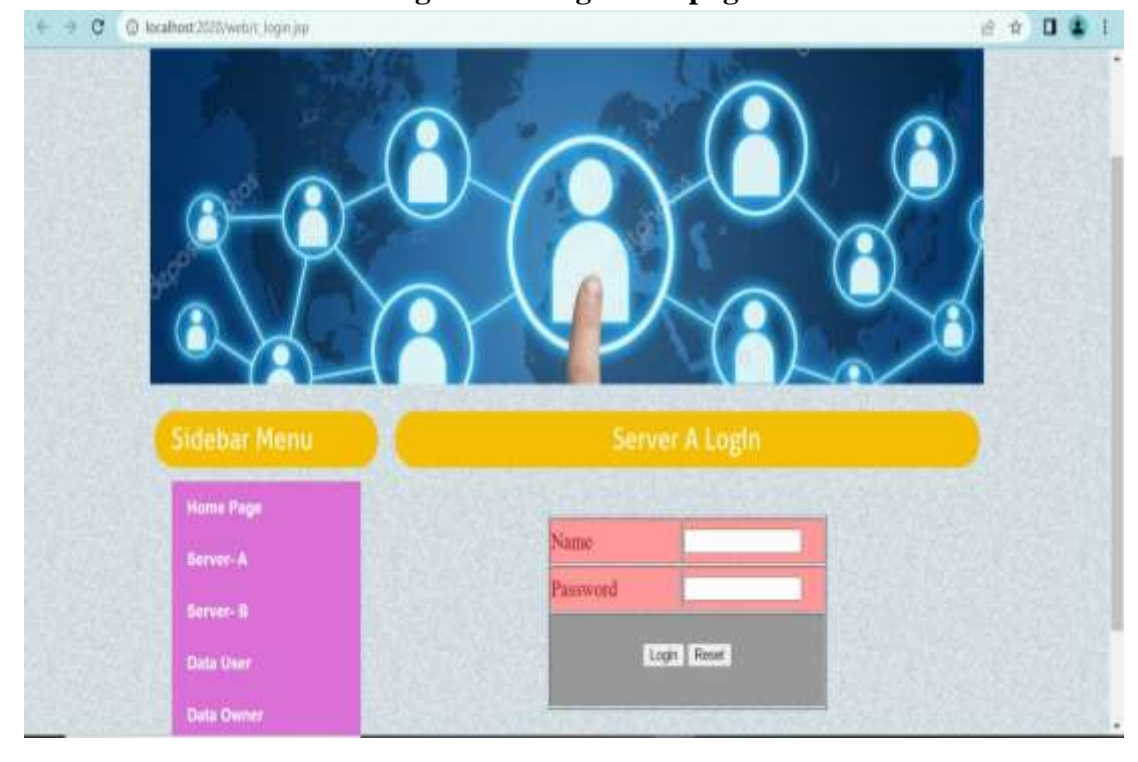
Fig 3: Showing Server A Login page