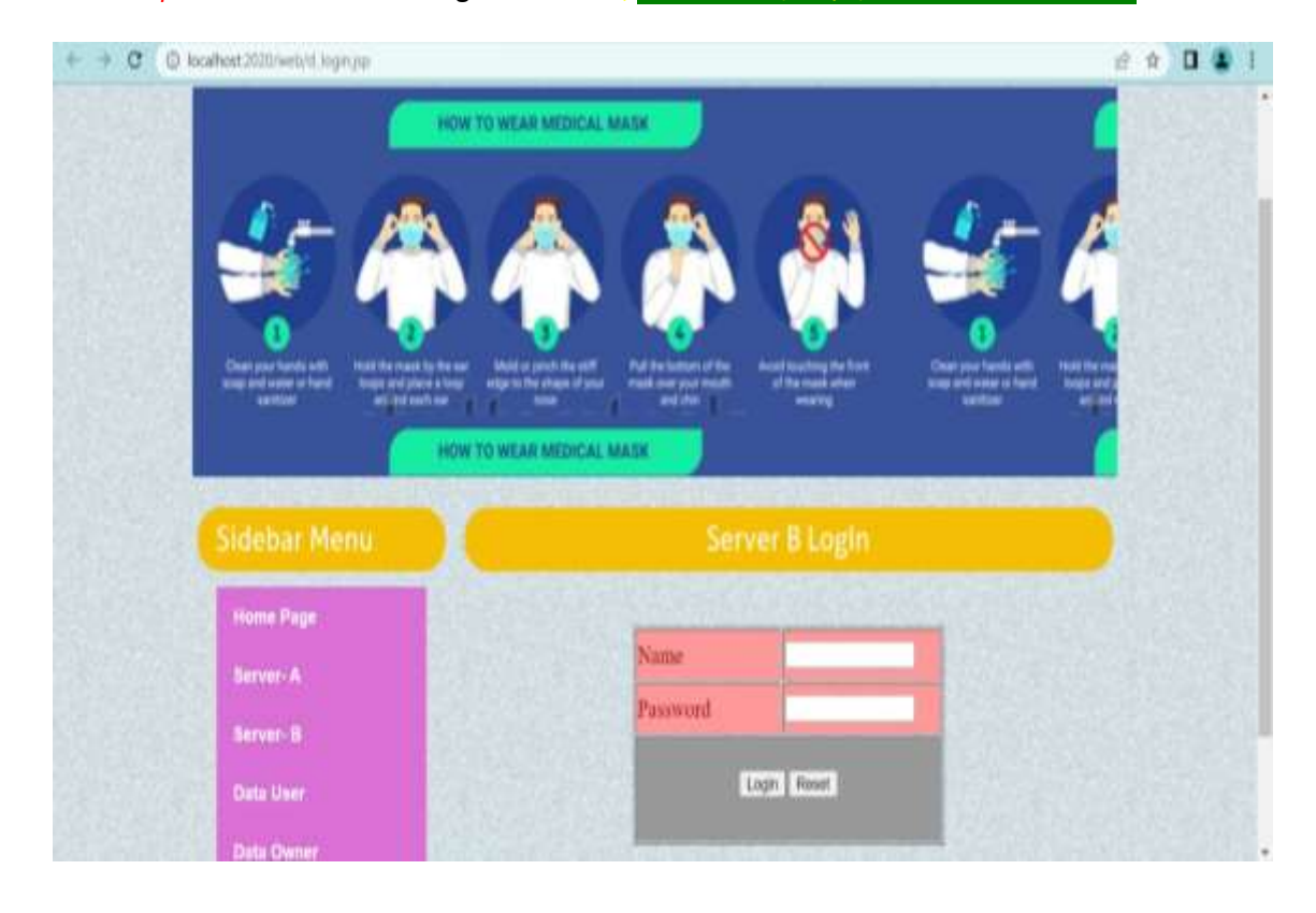
Fig 4: Showing Server B Login page

Research Paper © 2012 IJFANS. All Rights Reserved, UGC CARE Listed ( Group -I) Journal Volume 11, Iss 12, 2022