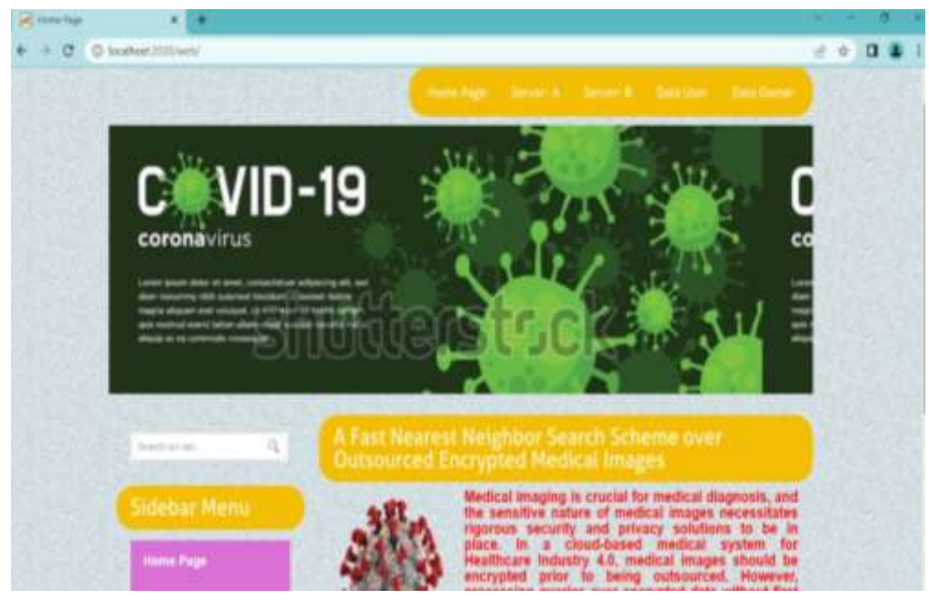
Fig 2: Showing Home page