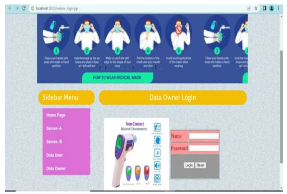
Fig 6: Showing Data Owner Login page

Research Paper © 2012 IJFANS. All Rights Reserved, UGC CARE Listed ( Group -1) Journal Volume 11, Iss 12, 2022