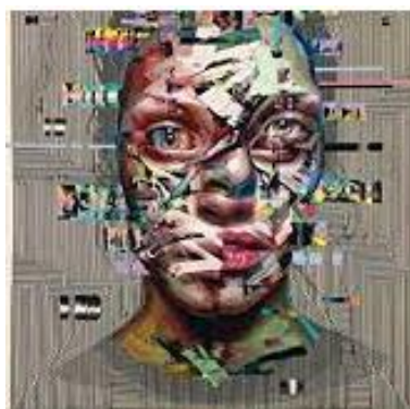
Figure 4: Local Voices in Digital Humanities and Regional History

The field of Digital Humanities (DH) presents a unique and powerful opportunity to delve into regional histories and unearth the often-overlooked experiences and perspectives of local communities.