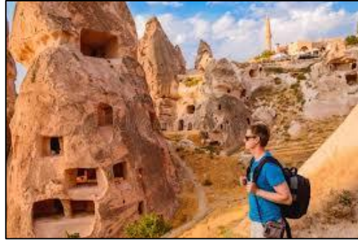
Figure 3: Historical regions

This view holds that more seasoned political and mental designs impact spatial-social character more than the contemporary world, which is bound to and frequently dazed by its own perspective, for example, the country state.