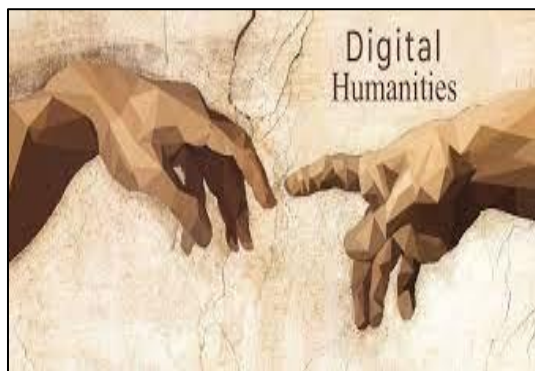
Figure 1: Digital humanities

The early emphasis was on the computer's ability to create and organize vast historical text concordances and thesauri. During the 1970s and 1980s, trailblazers like Wisbey helped fabricate a worldwide local area of humanities processing experts from different fields who created computational techniques to oblige the perplexing and changed structures in humanities researchers' essential materials [9].