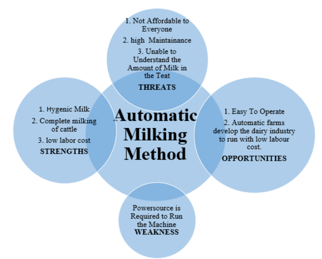
Figure 2: Illustrates the SWOT Analysis of Automatic Milking Method which is Now Adapted by Farmers in the World.

Most often, milking devices that the user operates on the farm are utilised for automated milking. The devices' primary energy source is electricity, and the motor and compressor for regulating pressure are utilised to extract milk from the teats of cows. The SWOT analysis of the automated milking technique to evaluate the benefits and drawbacks is shown in Figure 2. The machines' ability to produce high-quality milk while using less work is their main strength. The updated technique employed on large farms, particularly those with a large number of cattle, is the milking parlour. The goal of creating such a parlour is to milk more animals at once in order to shorten the process.