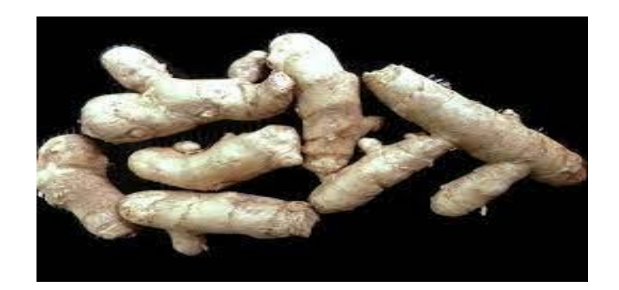
Figure 2:Showing rhizome of C. Zedoaria