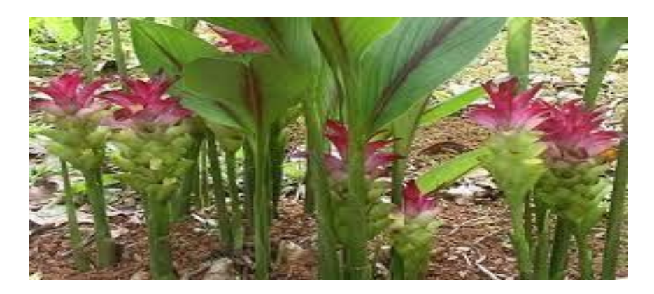
Figure 1: Showing C. zedoaria plant

C. zedoaria is a tuberous herb which generally grows to a height of 45cm and closely resembles to Curcuma longa (Yellow Turmeric) but has a less intense aroma ranging in between turmeric and mango. Root stocks are large and ovoid with many sessile tubers pale yellow or whitish from inside and 1 inch diameter. Leaves are large, 30-60cm long, oblong, glabrous, acuminate, narrow at the bottom, with purple from the middle. The petiole is green and longer than the blade. The flowers are pale yellow and shorter than bracts of the coma which is bright red in color overlapping the flower. Capsules ovoid, trigonous, smooth; vernal spikes; Calyx obtusely toothed, whitish and half as long as the funnel-shaped Corolla tube (Figure 1). The rhizome/fruits are triangular, elliptical, smooth with 3-valved capsules, and seed are white, oblong, arillate.<sup>3,5</sup>