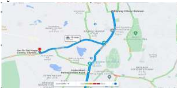
Figure 4: Road profile of old-alwal to Bolarum

that use this road. These vehicles comes from different zones of secundrabad region and medchal regions.