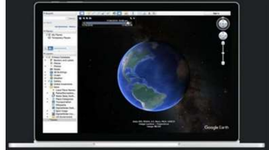
Figure 2: User interface of google earth pro software LITERATURE REVIEW

Google Earth is a computer program, formerly known as Keyhole Earth Viewer, that renders a 3D representation of Earth based primarily on satellite imagery. The program maps the Earth by superimposing satellite images, aerial photography, and GIS data onto a 3D globe, allowing users to see cities and landscapes from various angles.