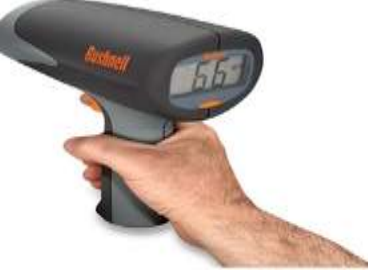
Figure 1: speed Gun

A radar speed gun is a doppler effect unit that may be hand-held, vehicle-mounted or static. It measures the speedof the objects at which it is pointed by detecting a change in frequency of the returned radar signal caused by the doppler effect, whereby the frequency of the returned signal is increased in proportion to the object's speed of approach if the object is approaching, and lowered if the object is receding. Such devices are frequently used for speed limit enforcement,