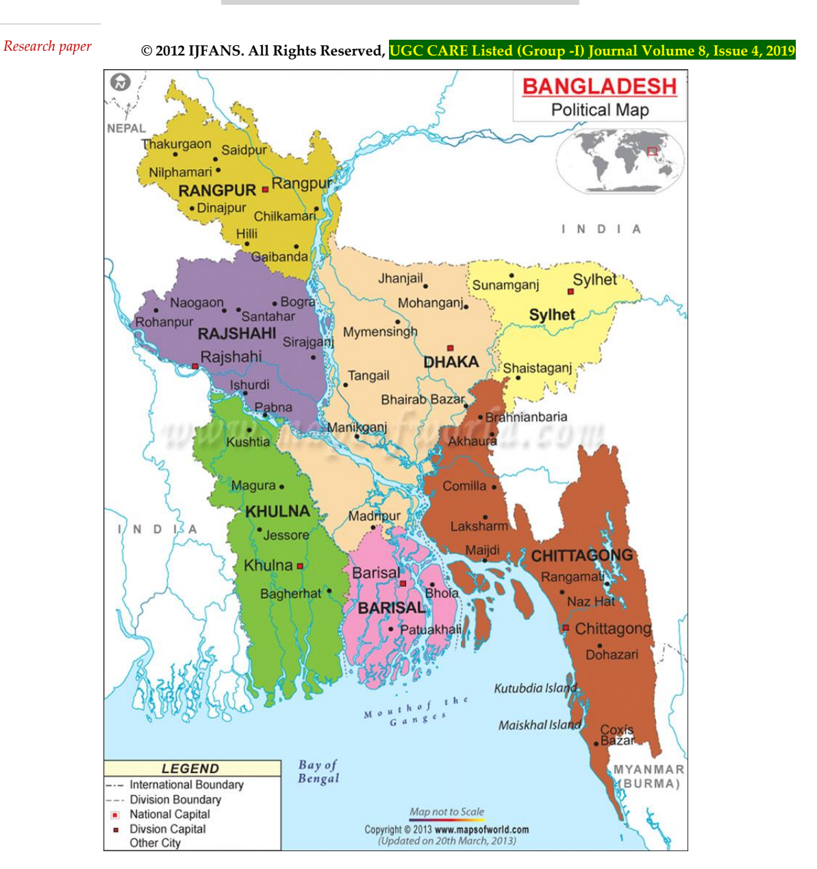
Map of Bangladesh

Show Districts and the other boundaries Source: Bangladesh revolution and its Atrmath – Talukader Maniruzzaman – University Press – Page No. 87