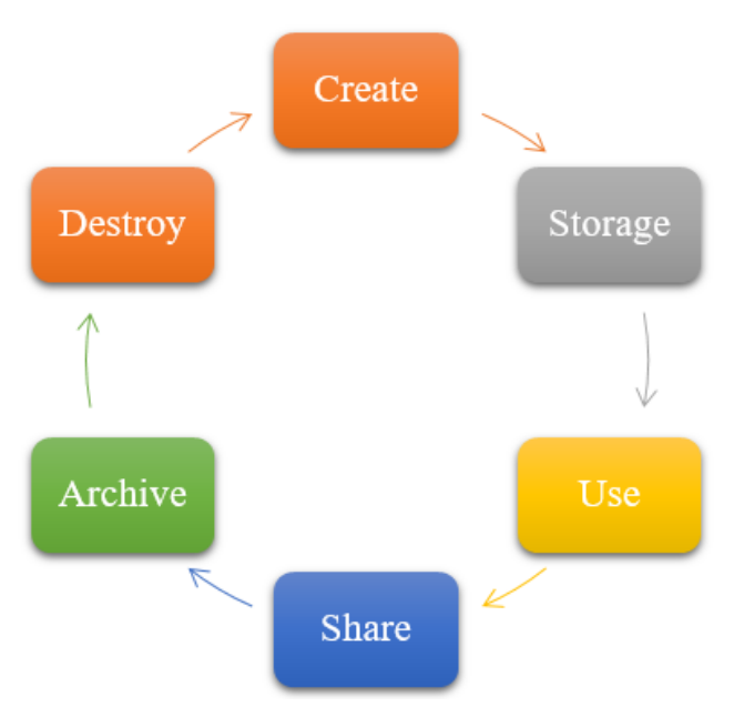
Figure 2: Indicating the Data Security Lifecycle on the Cloud.

queries and calculations. To ensure availability, it is crucial to be able to establish and confirm that provider data complies with the standards outlined in existing service level agreements (SLAs) between clients and manufacturers. The particulars of the different scenarios will determine the challenges that must be overcome, the restrictions that must be removed, and the specific guarantees that must be provided to guarantee that the safety measures outlined above are satisfied. For instance, in a simple case when a worker just utilizes the data center for storage, concerns and problems include ensuring the security, confidentiality, and integrity of the data being stored as well as customer satisfaction regarding service level commitments.