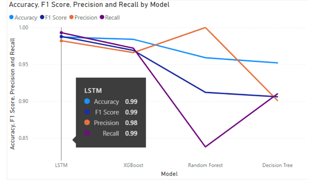
Figure3 Line Graph of performance metrics of 4 models

Figure 2 Graphical representation of performance metrics over 4 models