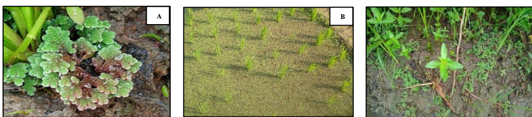
Plate 1. A) Azolla sp. habit; B) surface of the paddy field covered by Azolla sp.; C) Azolla species associated with wetland plants

Azolla sp. is a tiny free-floating fresh water fern (Plate 1) of tropical and sub-tropical Asia, Africa and America (Mishra and Dash, 2014). The name Azolla is derived from Greek word azo (to dry) and allyo (to kill) meaning that plant dies when it dries (Svenson, 1944).