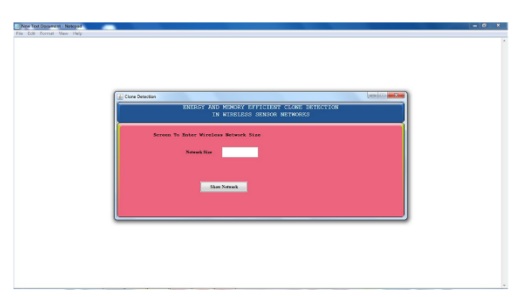
Fig 1: Welcome text display