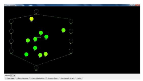
Fig 2: Network with given number of nodes