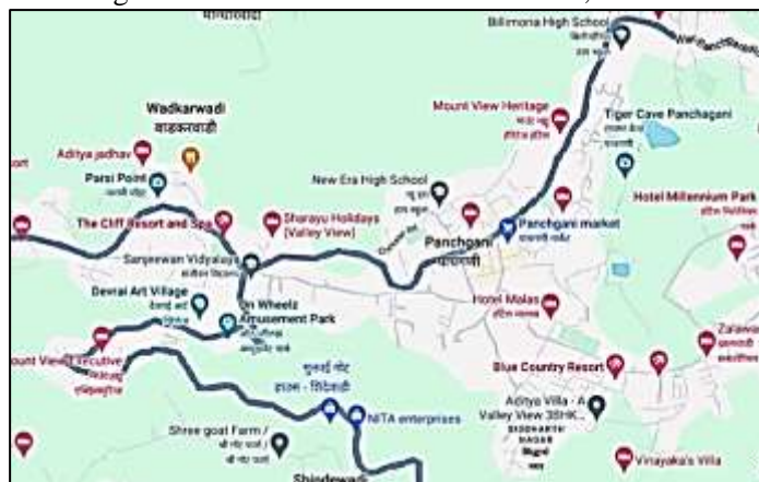
Location Map- Panchgani (MS) India

Panchgani is stretched between 17.920 N longitude and 73.79 0 E latitude. Particularly in the region of western Maharashtra, India. It is collected on living angiospermic plant leaves from the North-East region of Panchgani and immediately carried to the laboratory and preserved inside the paper box taking prior precaution of decay, dehydration and insect infestation. The collected specimen were numbered and labeled according to the location and date of collection,