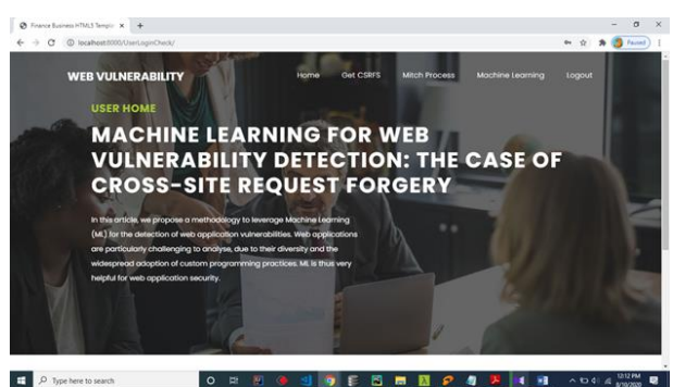
Getting website csrfs: