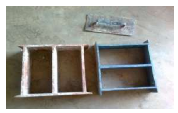
Fig. 1: Concrete bricks moulds.

Research paper© 2012 IJFANS. All Rights Reserved, Journal Volume 11, Iss 10, 2022