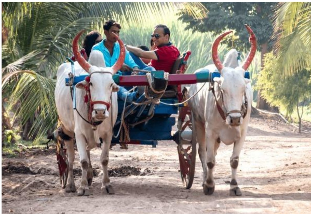
Bullock Cart Riding