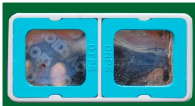
Fig.2. Direct Radon and Thoron progeny sensors.

Aluminized Mylar (50 \mu m) 212Po-8.78MeV( \alpha -Particle)