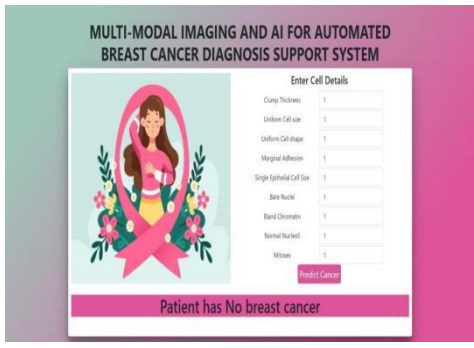
Figure 3: Output screen of patient with no breast cancer