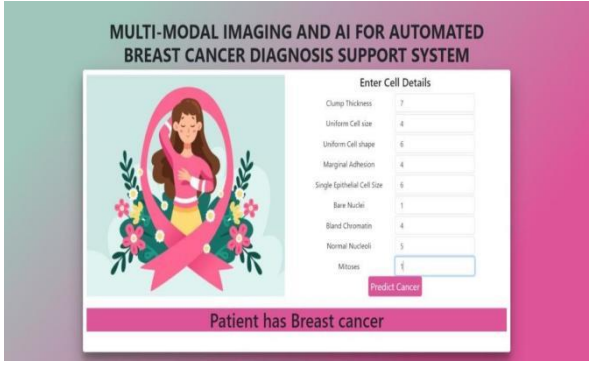
Figure 2: Output screen of predicting cancer with random values