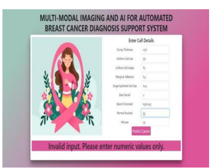
Figure 4: Output screen of entering invalid inputs