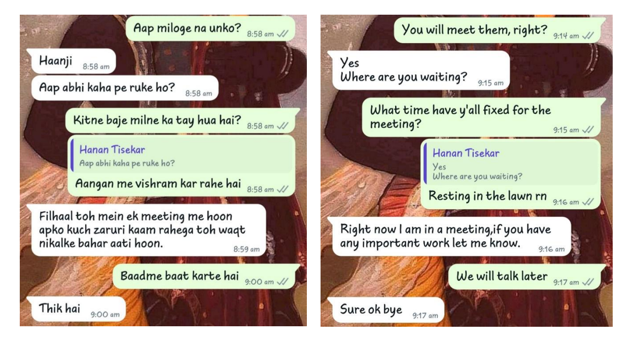
Conversation in Hindi language by using English alphabets v/s Same Conversation in English language.

to recognize that language is a living entity, shaped by the needs, preferences, and communication practices of its users. While some changes might challenge traditional norms, they also reflect the adaptability of language in the face of changing contexts and technologies. Balancing the convenience of modern tools with the need for strong language skills remains an ongoing challenge for education and communication in the digital age.